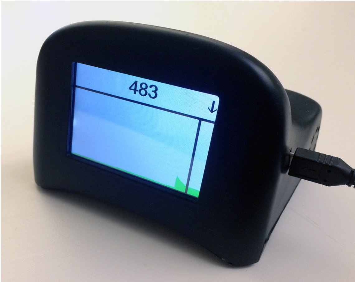
Figure 1: Speck-A (Bartley 2014).

Further, we argue that Speck use is not limited to a neoliberal framework of individual accountability. Designed to be sold on the market, the Speck could be viewed as a neoliberal response to air pollution and characteristic of attempts to manage structural health problems through individual consumption (Szasz 2007; Steinberg 2010). Yet, we counter the anticipated critique of “green liberalism” in the context of EHP’s PEM and suggest an alternative formulation.