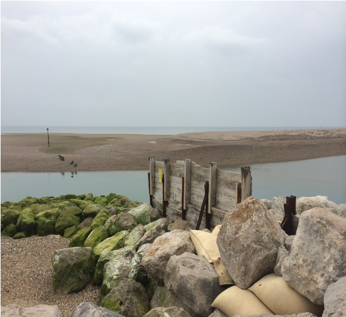
Image 6. Sea defenses III Groins, sandbags and granite rock revetments

area has been designated a Site of Specific Scientific Interest (SSSI), as well as a Special Protection Area (SPA) with Ramsar Designation in order to facilitate the flourishing of these new species. Accordingly, the RSPB (the Royal Society for the Protection of Birds) has erected solar-powered electrical fences on the spit itself to keep foxes and other “predators” out.