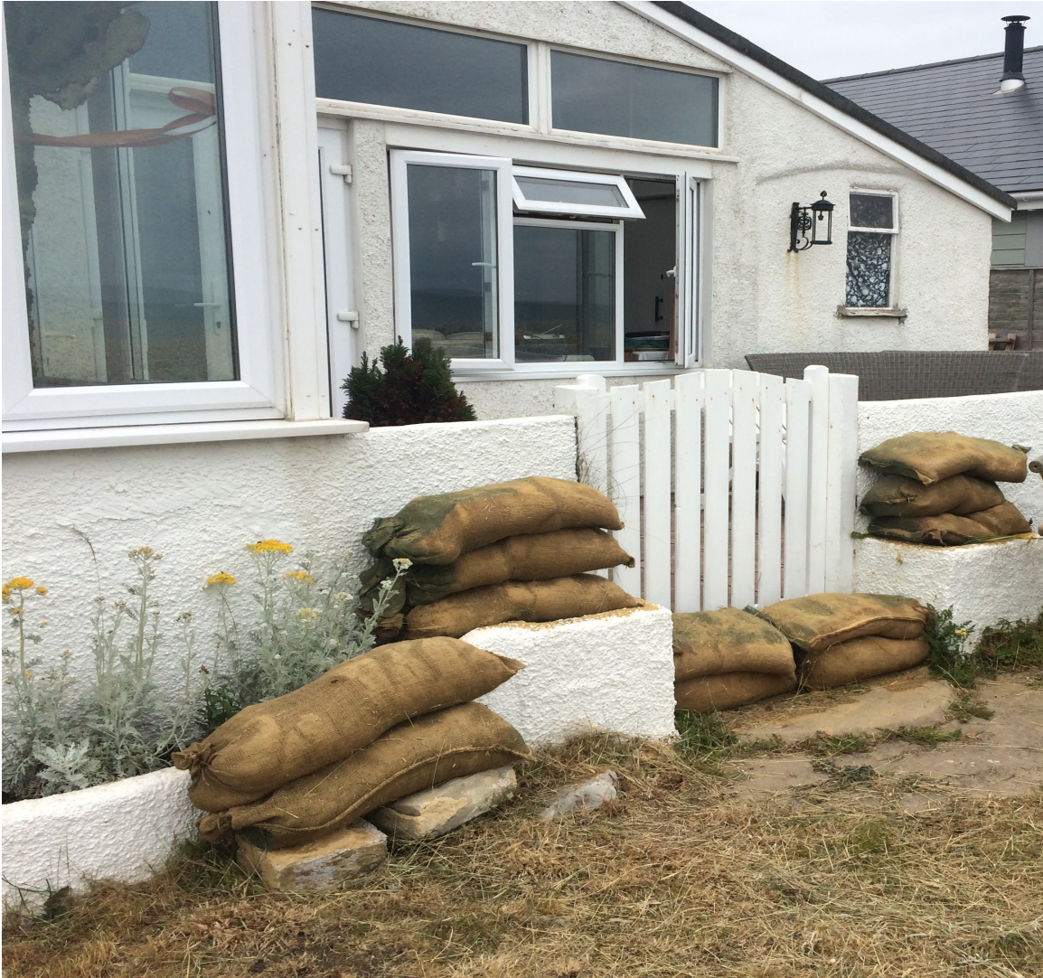
Image 5. Sea defenses II

In contrast, while this new environment has brought the threat of destruction to its human inhabitants, it has rapidly become a safe haven and breeding ground to a diverse range of new residents. Terns, previously inhabiting an island in the harbor (now taken over by black-headed gulls) can now be found nesting here, and there is talk of a rare species of snail living on the spit (although it cannot, apparently, be fully identified for fear of disturbing its habitat). The