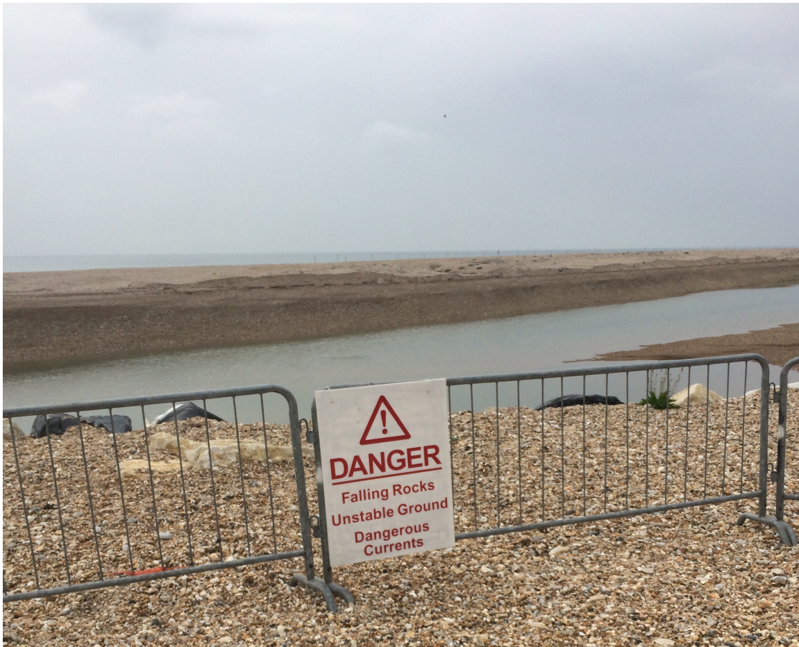
Image 2. Falling rocks, unstable ground, dangerous currents