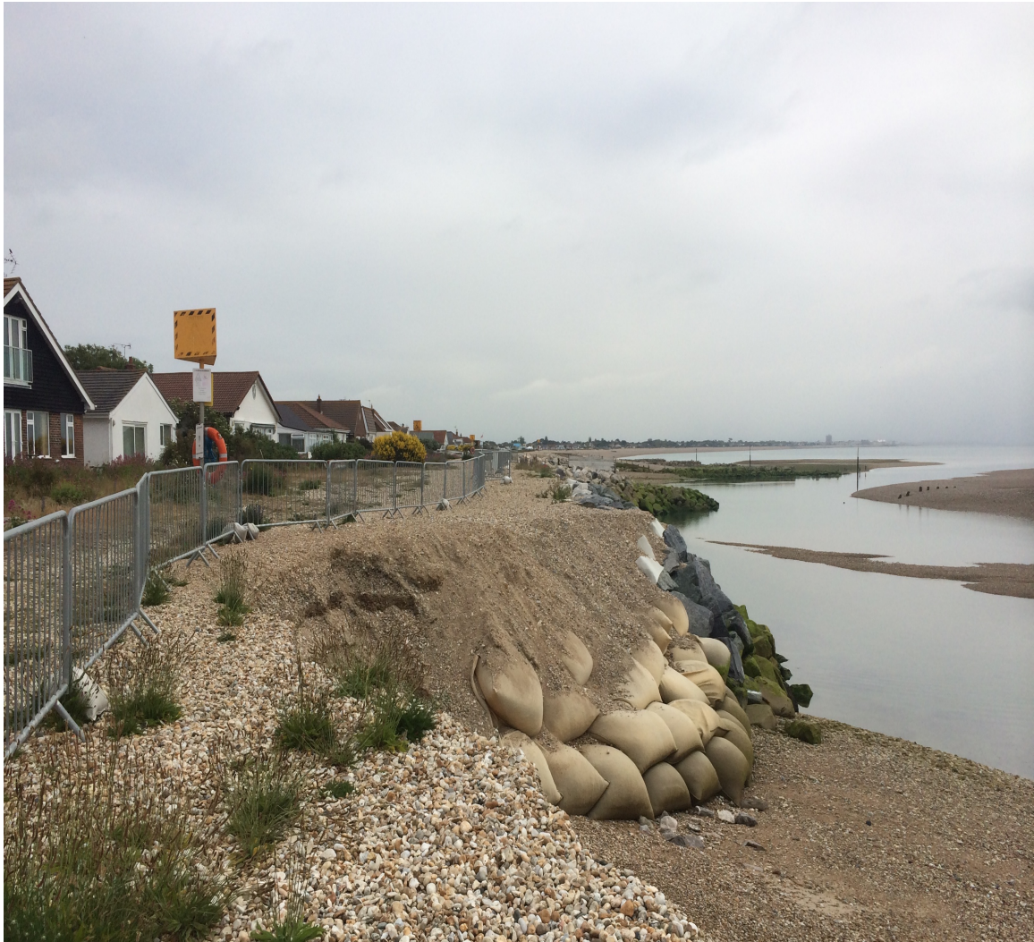
Image 3. Houses on the edge

relational balance that has allowed them to live at the edge of this land-sea-scape.