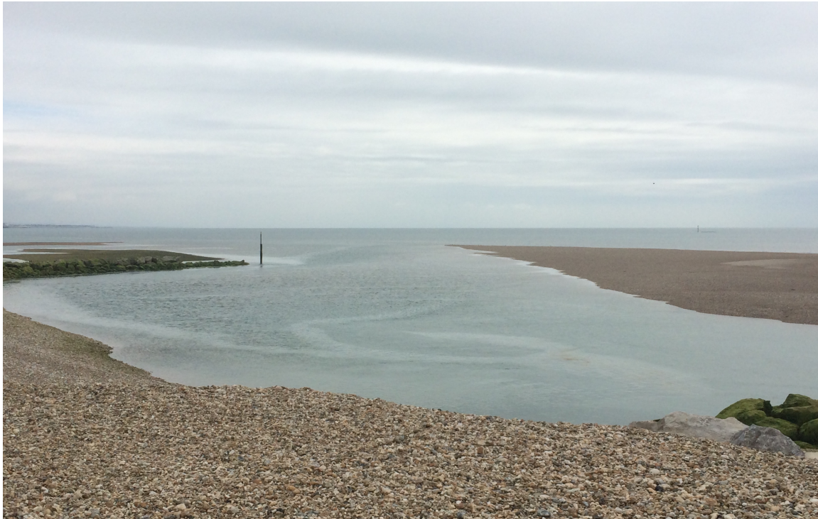
Image 8. The spit mouth

eroding the beach in front of the most westerly 15 houses. Three weeks after building this revetment, however, larger storms occurred and the spit grew by one meter per day. In fact, it grew 80 meters in 80 days, causing the revetments to destabilize in places.