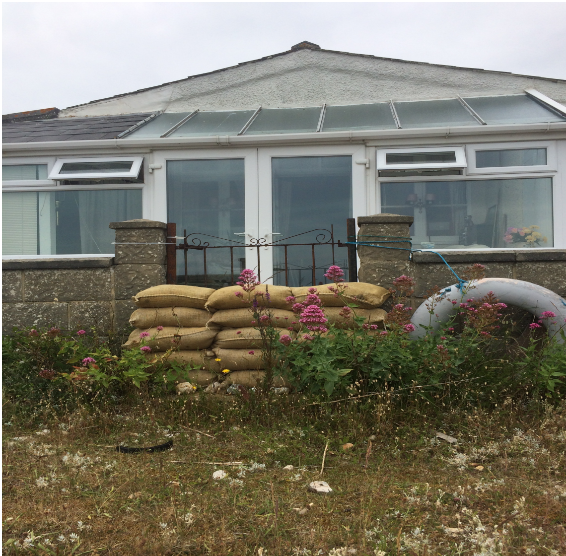
Image 4. Sea defenses I

The current caused by the spit is eroding the beach so quickly that some homes are now just six meters from the crest of the beach. In turn, daily tidal movements dislodge material from one place and assemble it elsewhere, destroying the beach further along. Since this massive change in their coastal landscape began, little, they feel, has been done to support and protect their homes despite their in-depth knowledge and suggestions. Shingle replenishments, a rock revetment, sandbags, and the maintenance of existing groins implemented by the local council have been of little use.