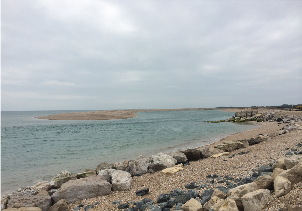
Image 7. The entrance to the spit

The local authority has adopted what it refers to as an “adaptive management policy” where “nature is allowed to take its course.” Adaptive management is an approach to environmental impact assessment and management that stresses the need for understanding the dynamics of ecosystems. It aims to reduce uncertainty over time, via a system of monitoring. Through this monitoring, it accrues information needed to improve future management (Holling [1978] 2005), allowing for a kind of recursive policy where changes in nature dictate, over time, how humans can intervene, if at all. Attributing non-human agency to the environment is a fundamental part of the theory of “adaptive management.”