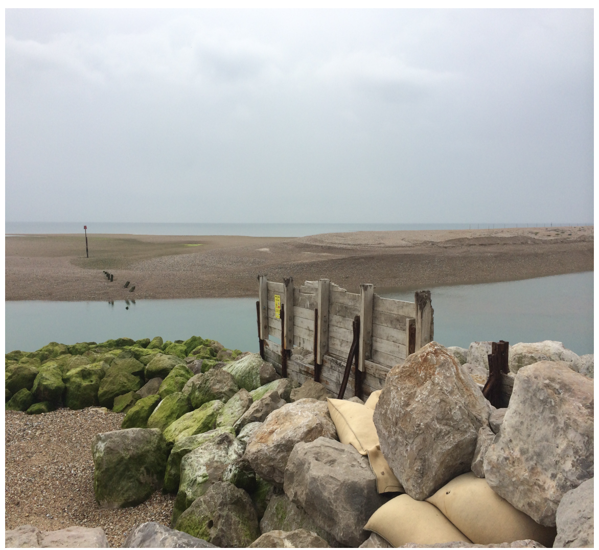
Image 6. Sea defenses III Groins, sandbags and granite rock revetments

area has been designated a Site of Specific Scientific Interest (SSSI), as well as a Special Protection Area (SPA) with Ramsar Designation in order to facilitate the flourishing of these new species. Accordingly, the RSPB (the Royal Society for the Protection of Birds) has erected solar-powered electrical fences on the spit itself to keep foxes and other "predators" out.